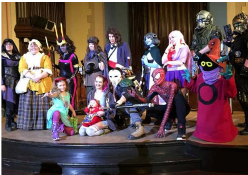
More than 400 people gathered for King Con 2019, enjoying an array of special guests, a vendor's market and the annual Kosplay Contest.