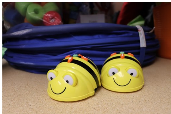
These adorable Beebots are in high demand for the library's many STEM Start and STEM Punks programs. We supported the purchase of more Beebots and Ozobots for fall 2018 programs.

"The Friends of the Library Gather and Create Space" will be animated with a range of maker programs in 2019, featuring sewing and needlecraft, visual arts, and music. Two Janome sewing machines were purchased with our support and will make their debut in sewing workshops planned for May and June.